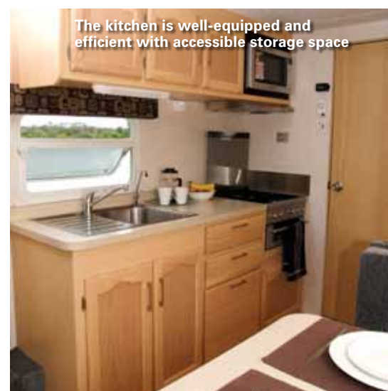
The kitchen is well-equipped and efficient with accessible storage space

The Sirius's welded aluminium frame means Cut Loose has opted for strength while endeavouring to keep tabs on weight. A VIN tare weight or unladen weight of 2900kg suggests that this 8m RV is not carrying too much by way of un-