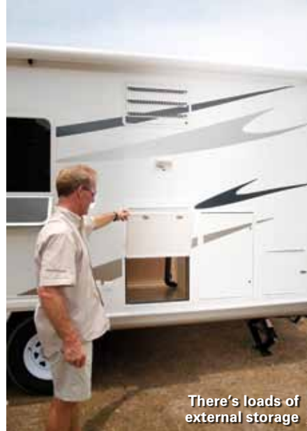
There's loads of external storage