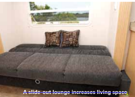
A slide-out lounge increases living space