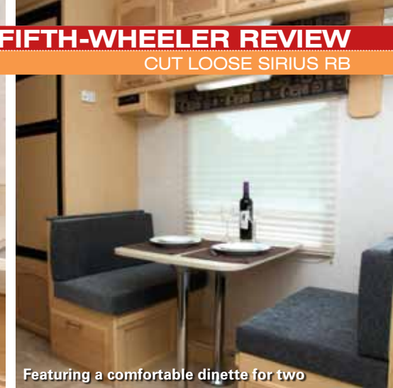
Featuring a comfortable dinette for two