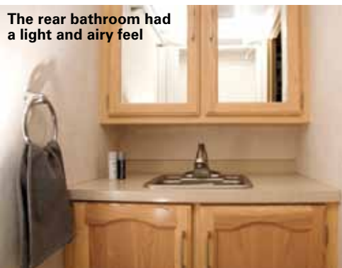
The rear bathroom had a light and airy feel

is open, light and breezy with a clean and comfortable character that talks of holidays anywhere while enjoying a fine meal or stretching out on the bed or lounge reading a good book.