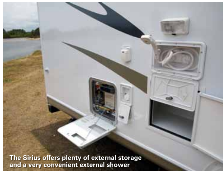
The Sirius offers plenty of external storage and a very convenient external shower