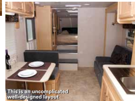
This is an uncomplicated well-designed layout